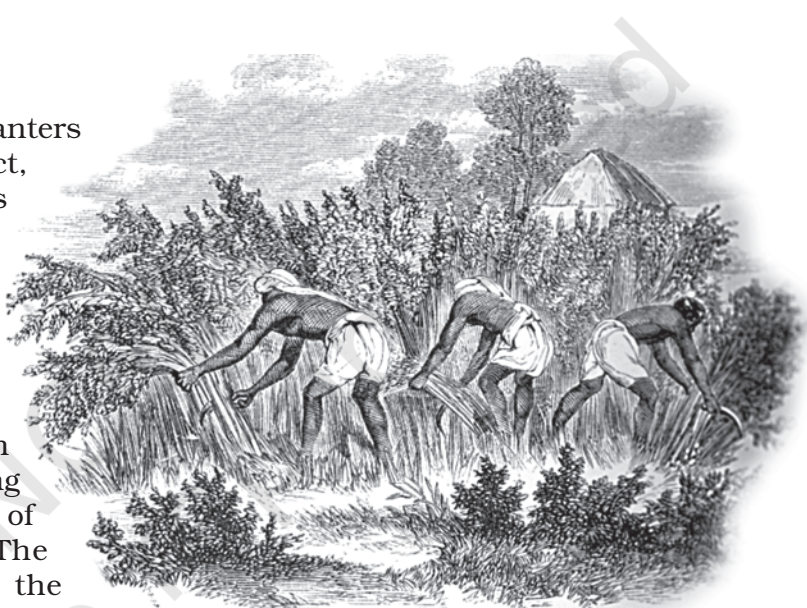
Fig. 8 – Workers harvesting indigo in early-nineteenth-century Bengal. From Colesworthy Grant, Rural Life in Bengal , 1860

Bigha – A unit of measurement of land. Before British rule, the size of this area varied. In Bengal the British standardised it to about one-third of an acre.