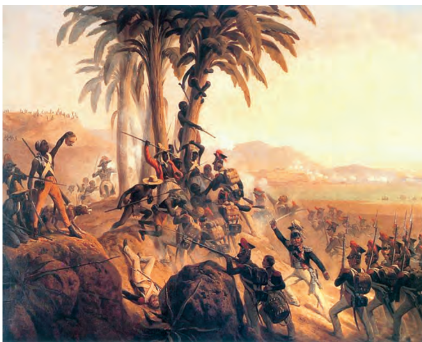
Fig. 7 – The Slave Revolt in St Domingue, August 1791, painting by Januarius Scuhodolski

In the eighteenth century, French planters produced indigo and sugar in the French colony of St Domingue in the Caribbean islands. The African slaves who worked on the plantations rose in rebellion in 1791, burning the plantations and killing their rich planters. In 1792 France abolished slavery in the French colonies. These events led to the collapse of the indigo plantations on the Caribbean islands.