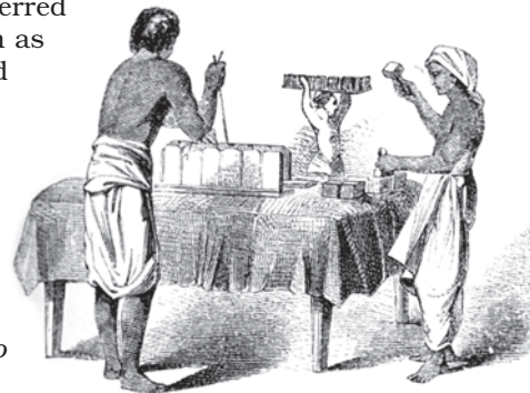
Fig. 13 – The indigo is ready for sale

Here you can see the last stage of the production – workers stamping and cutting the indigo pulp that has been pressed and moulded. In the background you can see a worker carrying away the blocks for drying.