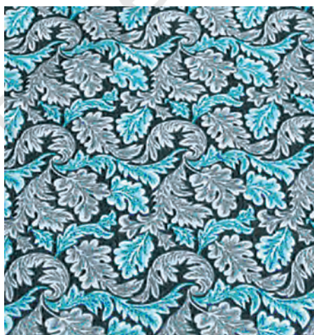
Fig. 6 – A Morris cotton print, late-nineteenth-century England