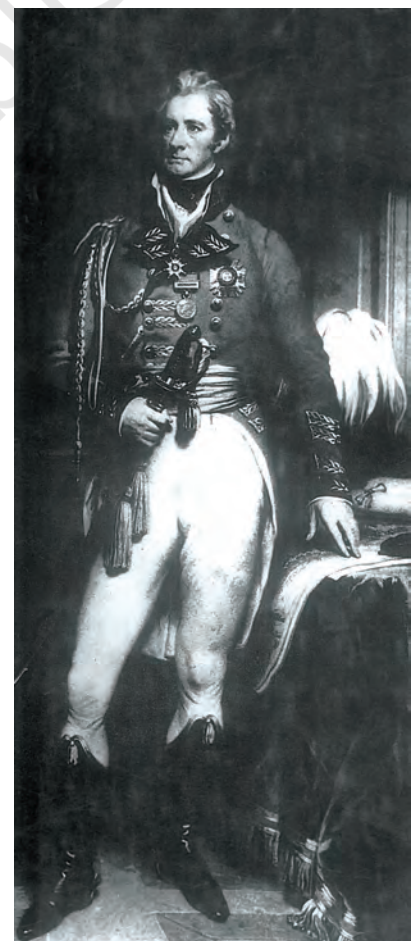
Fig. 4 – Thomas Munro, Governor of Madras (1819-26)

Mahal – In British revenue records mahal is a revenue estate which may be a village or a group of villages.