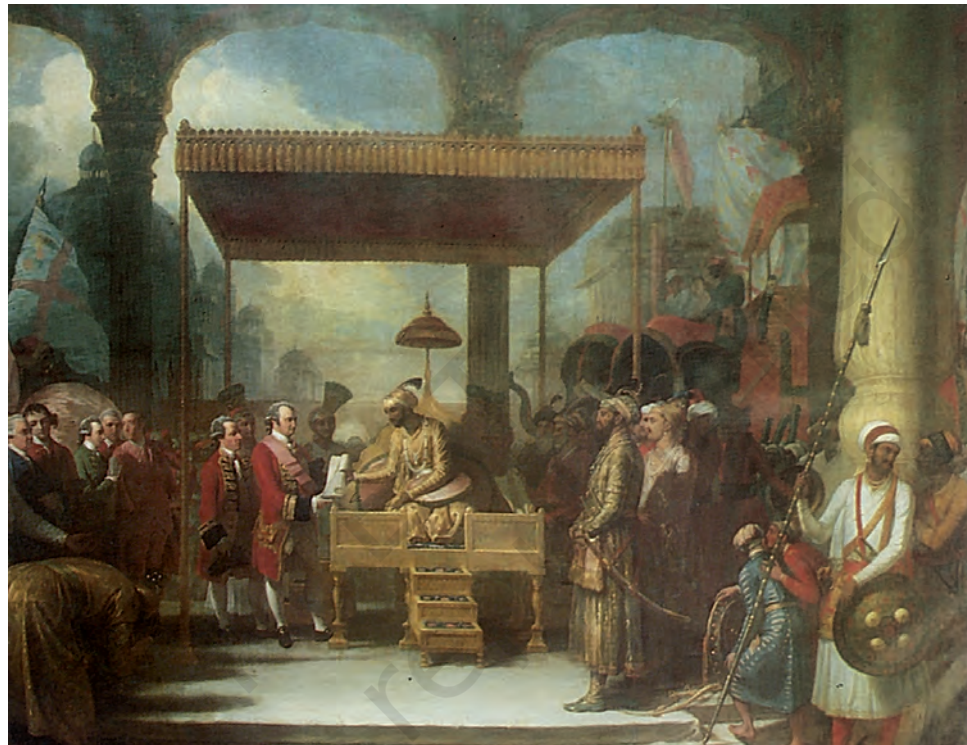
Fig. 1 – Robert Clive accepting the Diwani of Bengal, Bihar and Orissa from the Mughal ruler in 1765