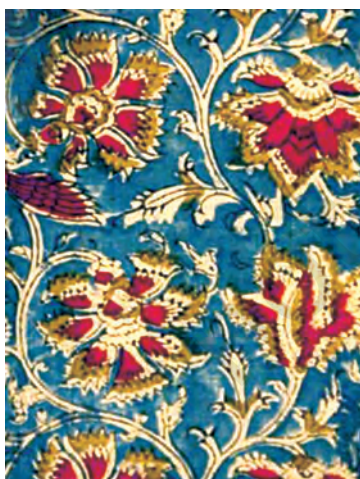
Fig. 5 – A kalamkari print, twentieth-century India

How was this done? The British used a variety of methods to expand the cultivation of crops that they needed. Let us take a closer look at the story of one such crop, one such method of production.