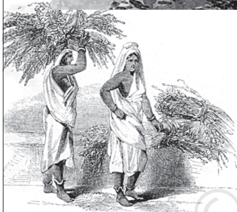
Fig. 11 – Women usually carried the indigo plant to the vats.

In the second vat (known as the beater vat) the solution was continuously stirred and beaten with paddles. When the liquid gradually turned green and then blue, lime water was added to the vat. Gradually the indigo separated out in flakes, a muddy sediment settled at the bottom of the vat and a clear liquid rose to the surface. The liquid was drained off and the sediment – the indigo pulp – transferred to another vat (known as the settling vat), and then pressed and dried for sale.