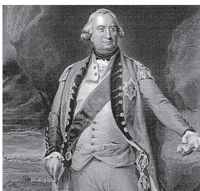
Fig. 3 – Charles Cornwallis Cornwallis was the Governor-General of India when the Permanent Settlement was introduced.