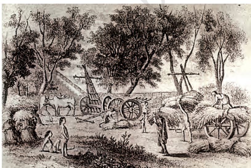
Fig. 9 – The Indigo plant being brought from the fields to the factory

In India the indigo plant was cut mostly by men.