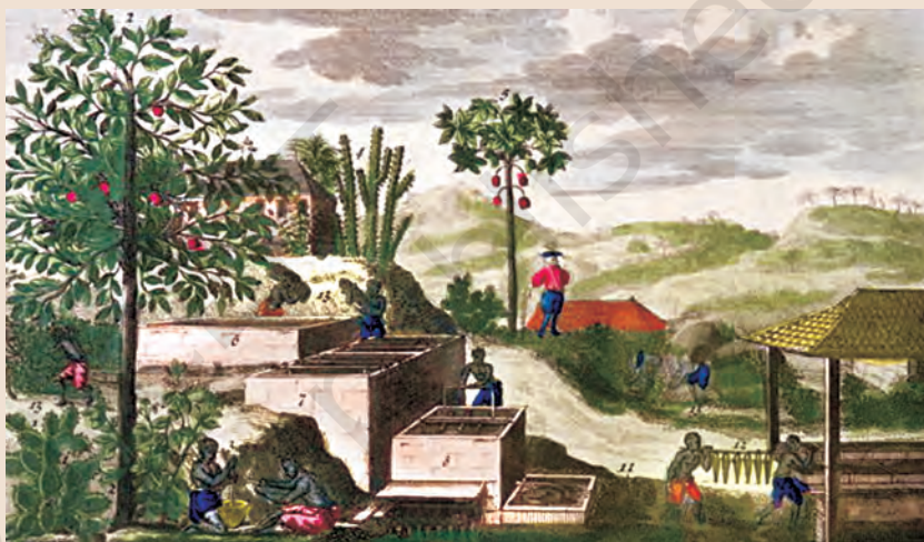
Fig. 14 – Making indigo in a Caribbean slave plantation

You can see the slave workers putting the indigo plant into the settler vat on the left. Another worker is churning the liquid with a mechanical churner in a vat (second from right). Two workers are carrying the indigo pulp hung up in bags to be dried. In the foreground two others are mixing the indigo pulp to be put into moulds. The planter is at the centre of the picture standing on the high ground supervising the slave workers.